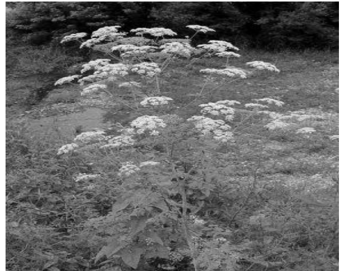
This photo is of Poison Hemlock, one of our area's Ten Most Noxious Weeds.